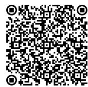
Scan for quick access