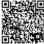
Scan for quick access