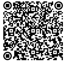
Find Your Nearest Location

Dates and Hours: *October 7 th – November 4 th , Monday - Friday (excluding Holidays), 10:00am - 3:00pm. **October 7 th – November 4 th , during regular city business hours. All sites open Election Day, November 5 th , 7:00am - 8:00pm.