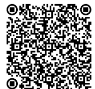
Scan for quick access