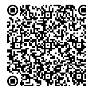
Scan for quick access